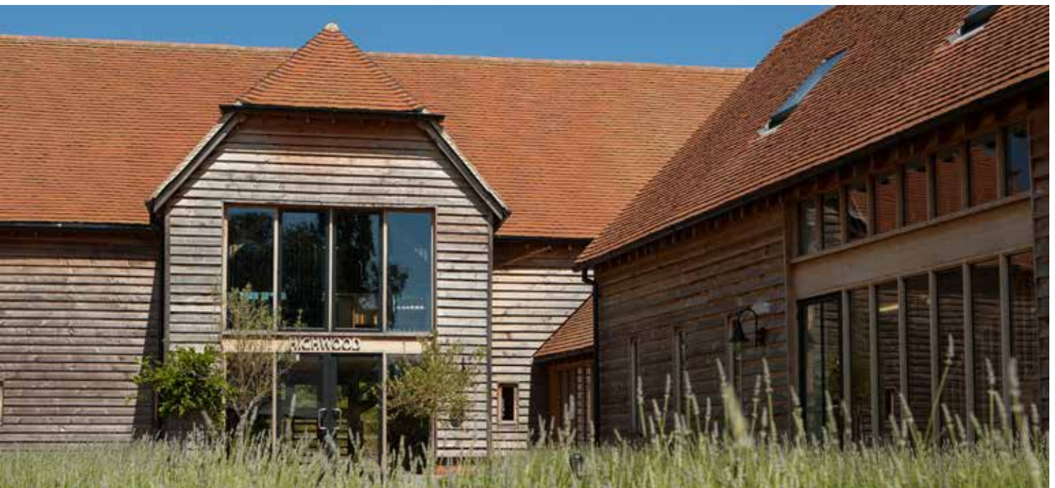
Our Head Office at Upper Ashfield Farm, Romsey, Hampshire.

Highwood has proudly sat at the forefront of innovative care and retirement development for over 10 years. When our founding directors founded Highwood, their primary focus was on the construction of prestigious care homes, extra care accommodation and retirement communities set in coveted locations that would serve a new generation of discerning residents.