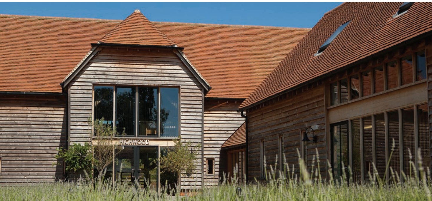
Our Head Office at Upper Ashfield Farm, Romsey, Hampshire.

Highwood has sat proudly at the forefront of innovative care and retirement development for over 10 years. When our founding directors founded Highwood, their primary focus was on the construction of prestigious care homes, extra care accommodation and retirement communities set in coveted locations that would serve a new generation of discerning residents.