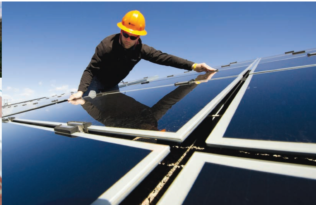
Sustainable as standard: electric car charging as standard, solar PV panels, A+ rated appliances and protected swales.